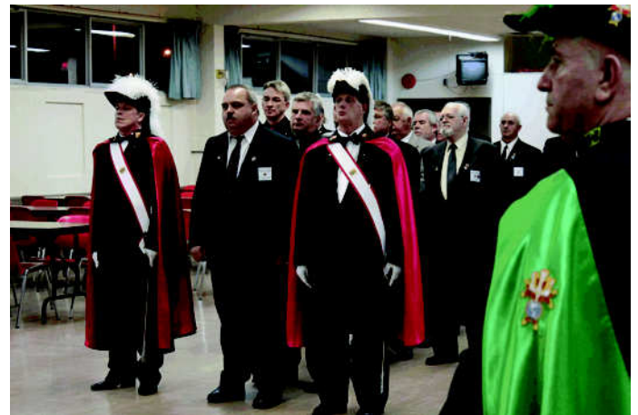
Installation of Officers for Terra Nova Council 1452 in October 2010